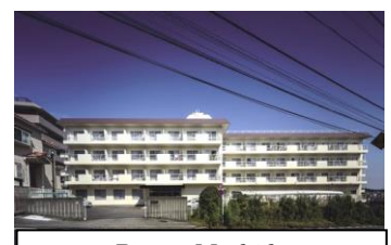
Dormy Machida (women only): 20 min to Shonandai Station by train