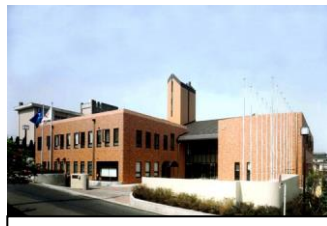
Dormy Futamatagawa (co-ed): 13 min to Shonandai Station by train