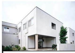
Dormy Yamato (men only) : 4 min to Shonandai Station by train