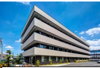
Dormy ShonanFujisawa2 (co-ed): 5min to SFC by Bus