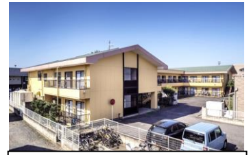
Dormy Chogo (men only) : 2 min to Shonandai Station by train