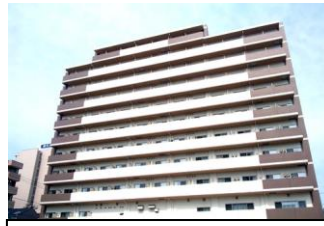
Dormy Shonandai (co-ed) : 4 min to Shonandai Station on foot