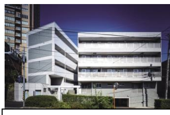
Dormy Higashi-Totsuka (women only): 20 min to Shonandai Station by train