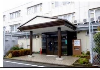
Dormy Shonandai Lei (women only): 5min to Shonandai Station on foot