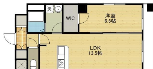
Example of a 1LDK room