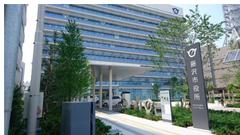
Fujisawa City Hall

The nearest city center is Shonandai Community Center next to Shonandai station. You can register your residence, join National Health Insurance, and National Pension at the city center as well.