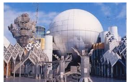
Shonandai Community Center